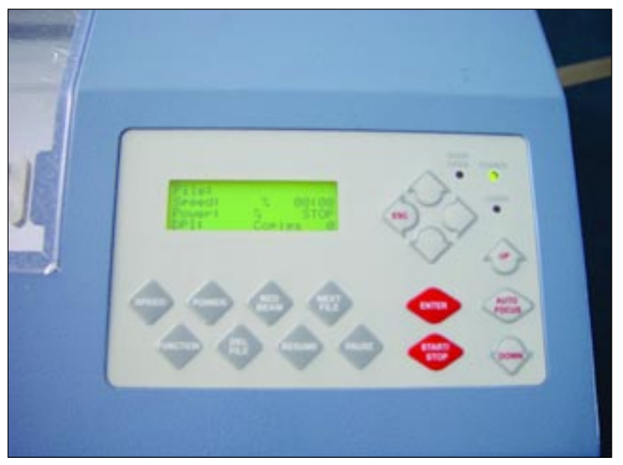
The control panel is simple and easy to use. The readout provides plenty of information about the job being engraved and the buffer allows for up to 99 jobs to be stored at a time.